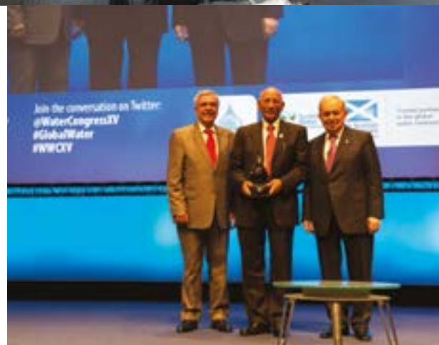
The Crystal Drop award ceremony at the XV th World Water Congress of the International Water Resources Association.