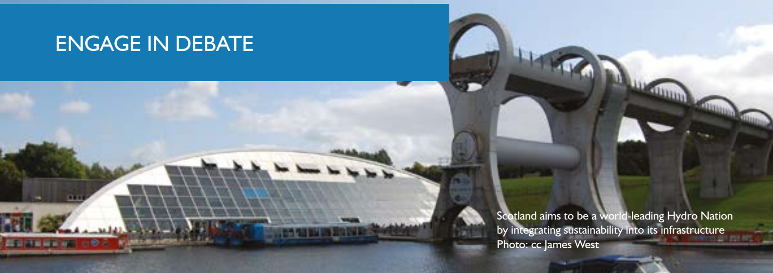
Scotland aims to be a world-leading Hydro Nation by integrating sustainability into its infrastructure