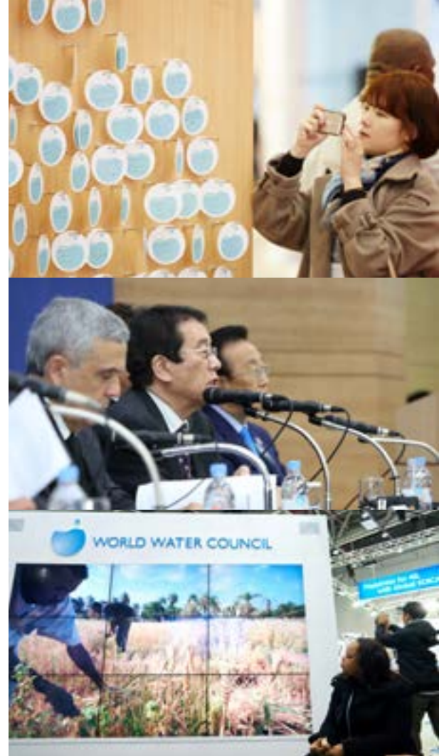
A visitor to the World Water Council Pavilion; The press conference on the day of the opening; The WWC's new video was launched during the 7 th World Water Forum.